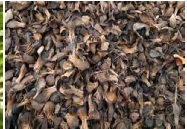
CROPS & RESIDUES : other agricultural or agro-industrial residues .