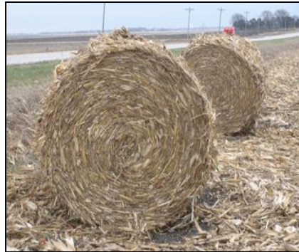
CROPS & RESIDUES : energy crops, corn, soy, sorghum