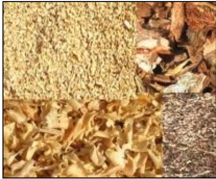
WOOD RESIDUES : forestry and lumber residues, etc.