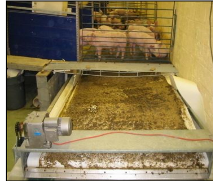
OTHER RESIDUES : Refuse-derived Fuel, swine residues, etc.